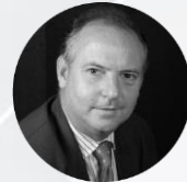
MODERATOR: GABRIEL CASTELLANO